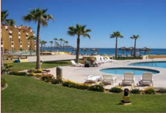
A variety of resorts, such as the Princesa de Peñasco, are located within walking distance to your CIPS classes at Las Palomas.

Your one-stop to fast and transparent bank trust for purchasing real estate in Mexico. We provide one of the fastest services, with many clients in the states of Baja California, Sonora, Jalisco and Nayarit, who have acquired their Trusts in a very fast and worry-free way.