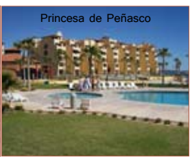
Princesa de Peñasco