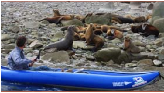
Swim, snorkel, dive or kayak amongst sea lions in their natural habitat at Bird Island. Great photo op!

techno or a faster pace, head to the Pink Cadillac, sip tasty margaritas on the patio at Playa Bonita while live music plays, or head up to JC's for a game of pool or a round of darts. Stop in Latitude 31 for your favorite sports on TV and a cool drink. Travelling Mariachis can be spotted performing throughout the town.